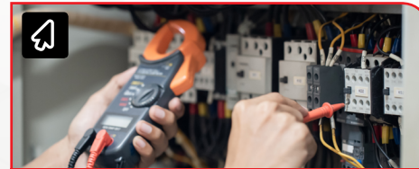
Test & Measurement