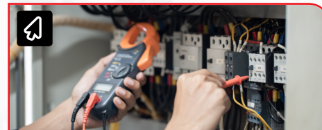
Test & Measurement