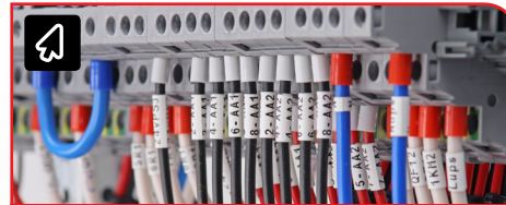
Wire Terminals & Splices