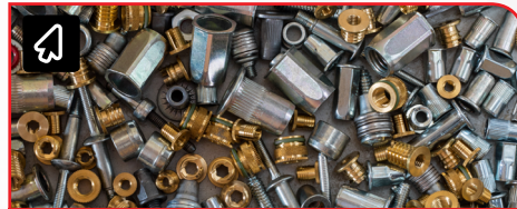
Fasteners & Fixings