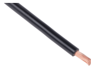
Hook Up Wire