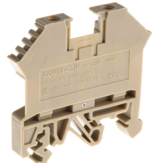
DIN Rail Terminal Blocks