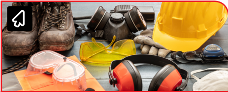
Personal Protective Equipment & Workwear