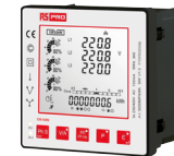
Multi Function Panel Meters