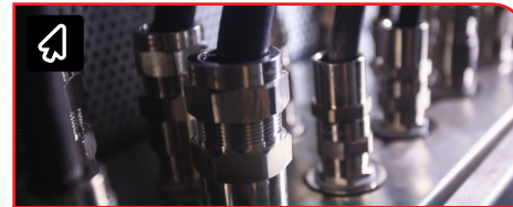
Cable Glands & Fittings