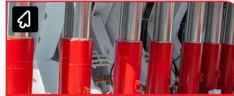
Motors & Drives