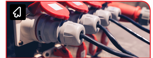
Mains & DC Power Connectors