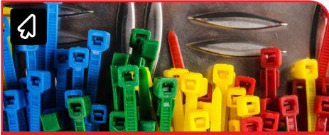
Cable Ties & Fixings