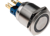
Push Button Switches