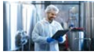
Caps and hairnets