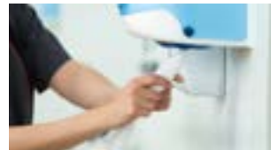
Paper and wipes