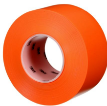
2629129 Orange Mfr. Part No : 7100260043