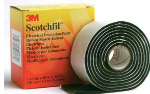
6113225 Black Mfr. Part No : 8000