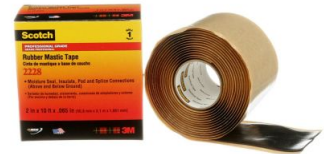
2695202 Black Mfr. Part No : 7000005986