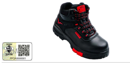
25533104017 Safety Shoe