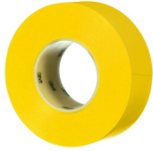
2629114 Yellow Mfr. Part No : 7100249185