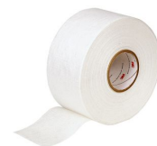
2347700 711.2 mm Mfr. Part No : 7000000528