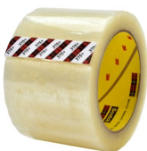
2695241 Polypropylene Mfr. Part No : 7100215092