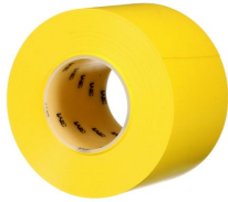
2629119 Yellow Mfr. Part No : 7100253142