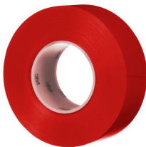
2629127 Red Mfr. Part No : 7100259699