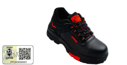
2553310416 Safety Shoe