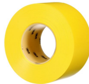
2629121 Yellow Mfr. Part No : 7100253513