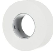
2629117 White Mfr. Part No : 7100251995