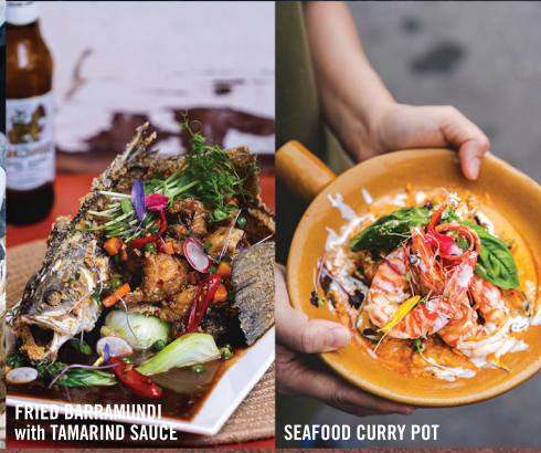
FRIED BARRAMUNDI with TAMARIND SAUCE