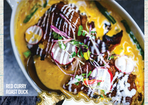
RED CURRY ROAST DUCK