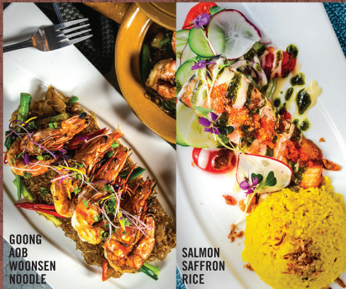
GOONG AOB WOONSEN NOODLE

GOONG AOB WOONSEN NOODLE ..... $29.9 Grilled King prawns & glass noodles cooked in clay pot w/soy sauce, sesame oil, garlic, ginger, shallot & celery