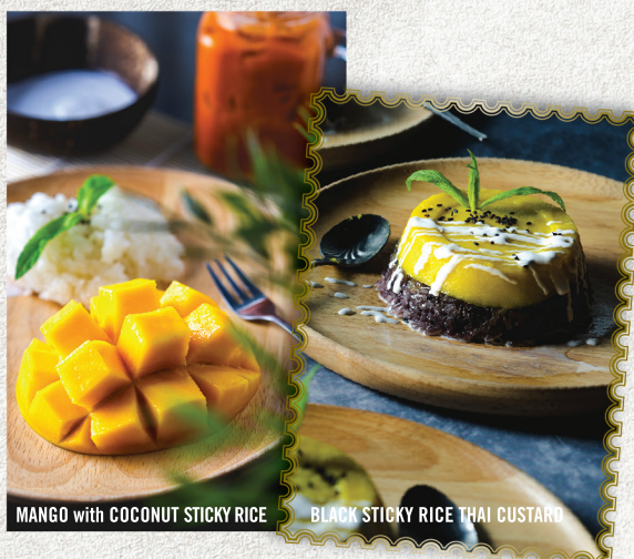
MANGO with COCONUT STICKY RICE

COCONUT STICKY RICE w/ MANGO (SEASONAL) .....$12.9