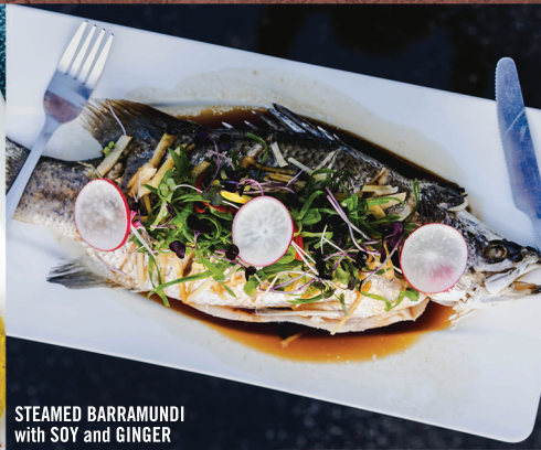
STEAMED BARRAMUNDI with SOY and GINGER