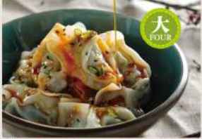
002 $12.00 Wonton in Red Chilli Sauce (10pcs) 紅油抄手