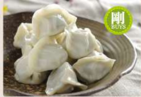
004 $12.80 Pork and Chive Dumplings (12pcs) 韭菜豬肉水餃