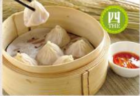
001 $12.00 Xiao Long Bao (8pcs) 灌湯小籠包

SPICY CHEF'S VEGETARIAN NUTS 外賣盒 Takeaway Container