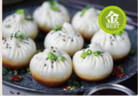
003 $12.00 Pan fried Pork Buns (8pcs) 招牌生煎包