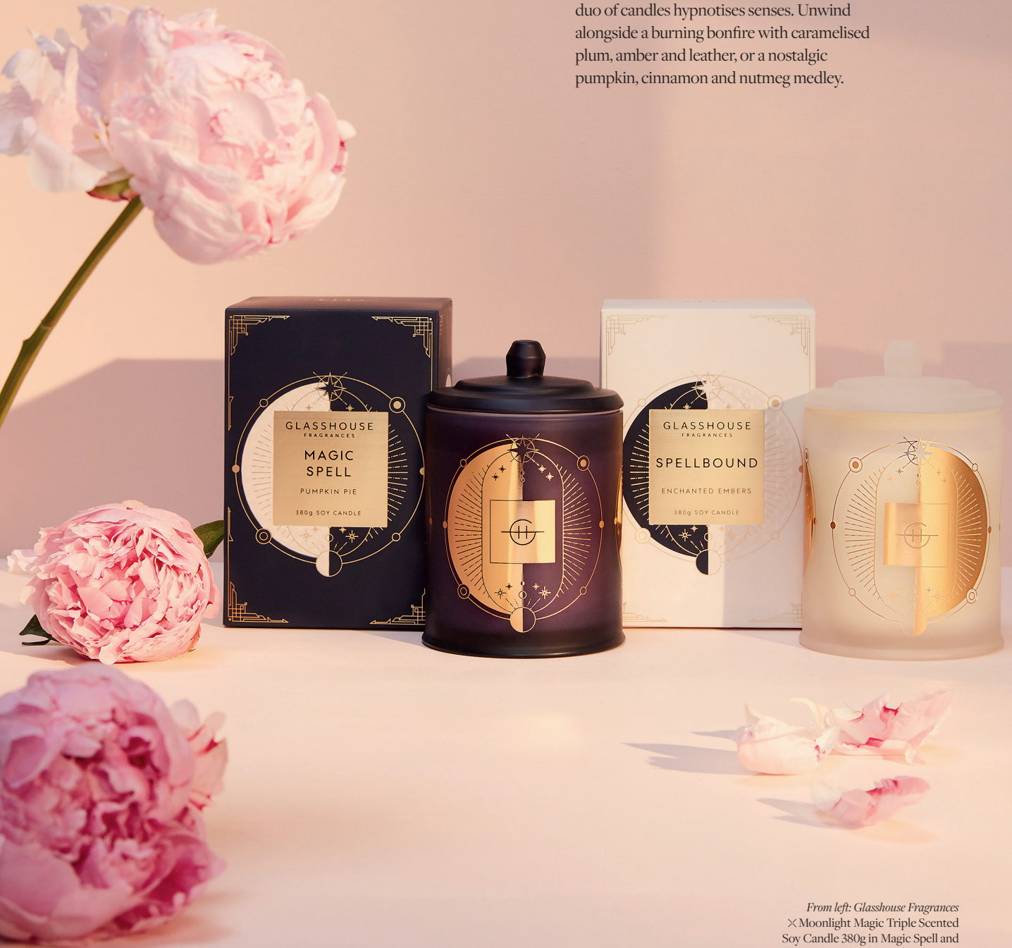
From left: Glasshouse Fragrances × Moonlight Magic Triple Scented Soy Candle 380g in Magic Spell and Spellbound, $54.95 each.

Warm and comforting, the limited edition duo of candles hypnotises senses. Unwind alongside a burning bonfire with caramelised plum, amber and leather, or a nostalgic pumpkin, cinnamon and nutmeg medley.