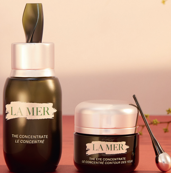
From left: La Mer NEW The Concentrate 30ml, $555, and NEW The Eye Concentrate, $315.

Strengthen, soothe and protect with this potent duo infused with La Mer's Concentrated Miracle Broth™, a powerhouse for restoring, fortifying and calming, to leave skin healthy and radiant.