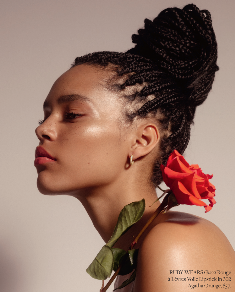
RUBY WEARS Gucci Rouge à Lèvres Voile Lipstick in 302 Agatha Orange, $57.