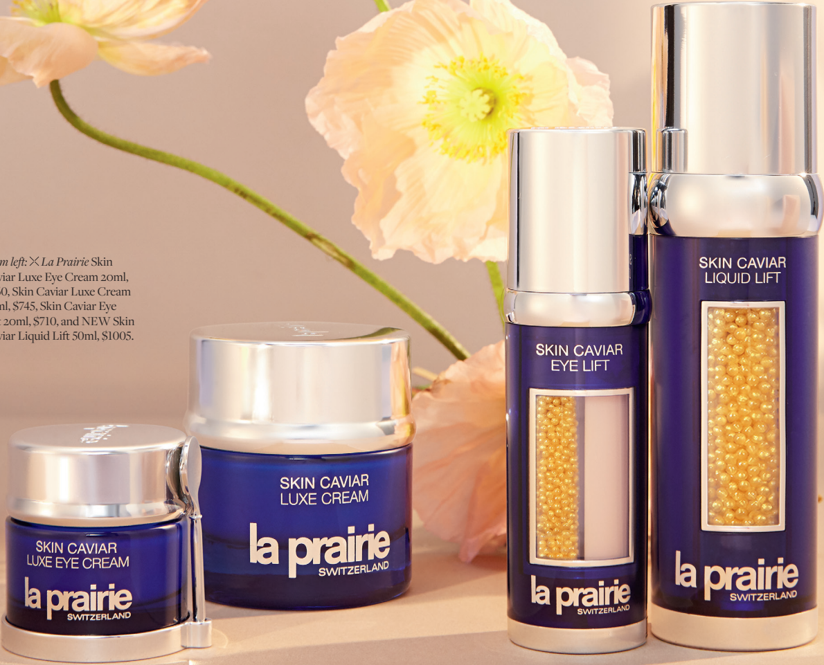
From left: X La Prairie Skin Caviar Luxe Eye Cream 20ml, $560, Skin Caviar Luxe Cream 50ml, $745, Skin Caviar Eye Lift 20ml, $710, and NEW Skin Caviar Liquid Lift 50ml, $1005.

La Prairie's Skin Caviar Collection is the pinnacle of science and luxury. All the products in the collection are infused with the benefits of caviar and La Prairie's Exclusive Cellular Complex. The Skin Caviar skincare ritual is a total indulgence, profoundly improving the appearance of elasticity and tone. Skin appears firmed and lifted.