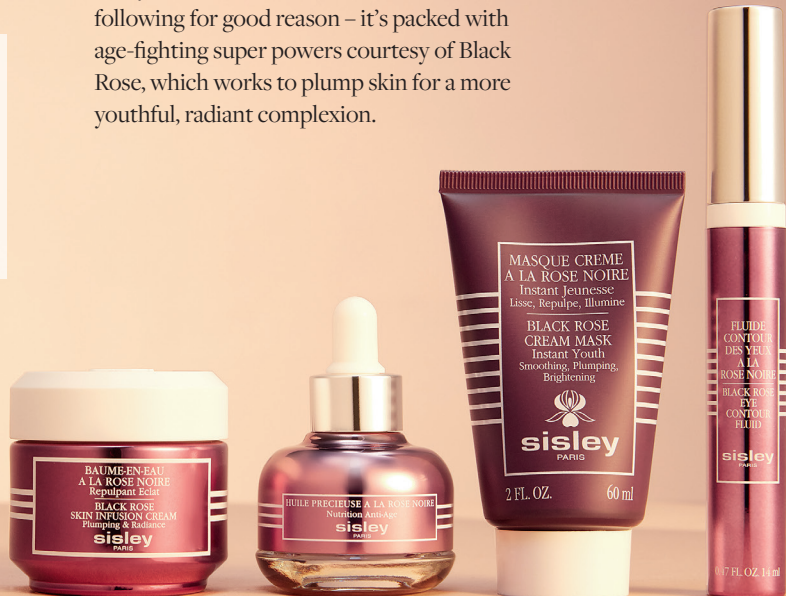
From left: ✕ Sisley Paris Black Rose Skin Infusion Cream 50ml, $260, Black Rose Precious Face Oil 25ml, $280, Black Rose Cream Mask 60ml, $200, and NEW Black Rose Eye Contour Fluid 14ml, $190.

Purchase a Sisley Paris Black Rose skincare product and enjoy a complimentary Black Rose Skin Infusion Cream 10ml*