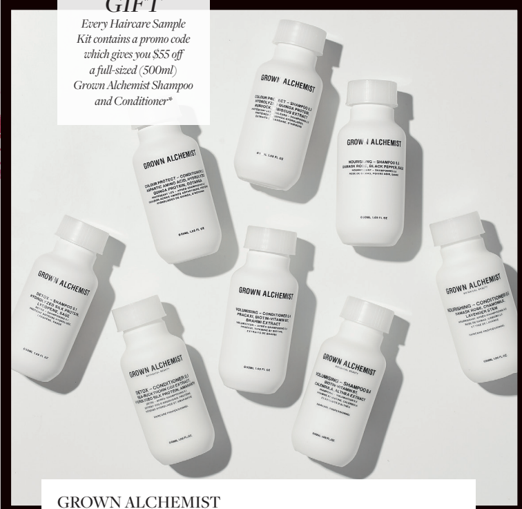
GROWN ALCHEMIST This exclusive kit from Australian clean-beauty brand Grown Alchemist has deluxe sizes so you can find your perfect formula. ×♡ Grown Alchemist Haircare Sample Kit, $55 for eight products and a complimentary toiletries case.

Every Haircare Sample Kit contains a promo code which gives you $55 off a full-sized (500ml) Grown Alchemist Shampoo and Conditioner*