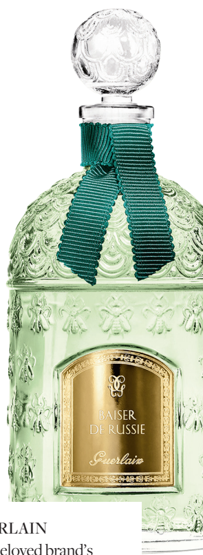
GUERLAIN The beloved brand's Exclusive Collection of unique scents need only be experienced once to never be forgotten. This one, all pine, lemon, jasmine and musk, is sure to elicit compliments. Guerlain × Baiser de Russie Eau de Parfum 125ml, $395.

GUCCI Gucci's nostalgia-heavy foray into beauty has been turning out solid gold. The latest luxurious eau de parfum is an homage to the frangipani. Wear it for an instant hit of spring and leave it out to adorn your dresser.