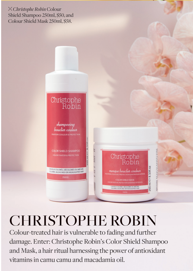
✕ Christophe Robin Colour Shield Shampoo 250ml, $50, and Colour Shield Mask 250ml, $58.