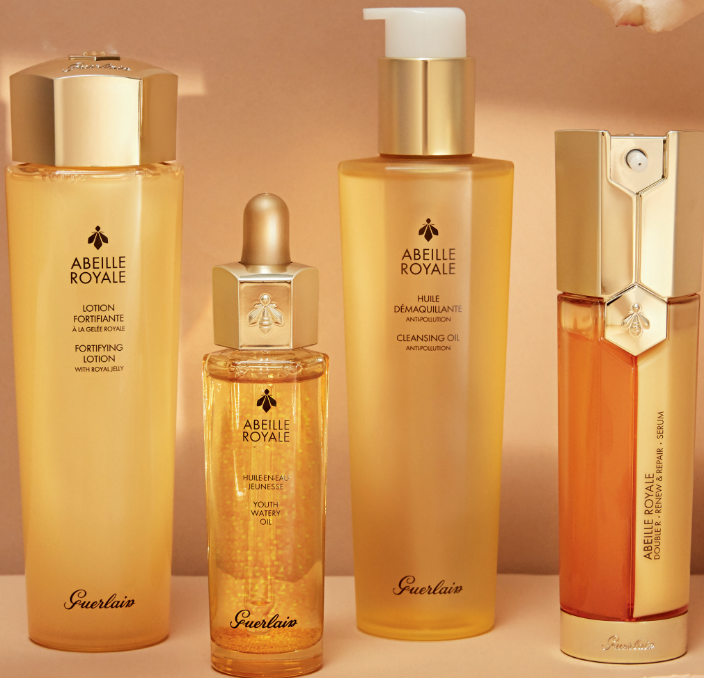
From left: ✕ Guerlain NEW Abeille Royale Fortifying Lotion 150ml, $110, Abeille Royale Youth Watery Oil 50ml, $206, NEW Abeille Royale Cleansing Oil 150ml, $94, and Abeille Royale Double R - Renew & Repair Serum 50ml, $304.

Guerlain's Abeille Royale skincare collection is the result of more than 10 years of scientific research into bees and the anti-ageing properties of Ouessant Black Bee Honey and royal jelly. This range works to revitalise skin and minimise signs of ageing, including wrinkles and fading firmness.