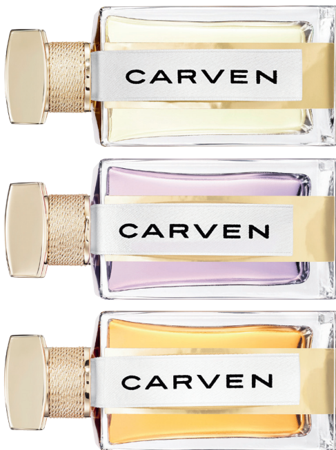
From top: Carven Collection Paris-Santorini Eau de Parfum 100ml, $190, Paris-Florence Eau de Parfum 100ml, $190, and Paris-Manille Eau de Parfum 100ml, $190.

Each of the Carven Collection perfumes is inspired by a journey from the brand's home in Paris, to an exotic and fragrant destination, including Santorini, Florence, Manila and São Paulo.