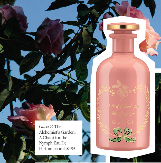
Gucci × The Alchemist's Garden: A Chant for the Nymph Eau De Parfum 100ml, $495.