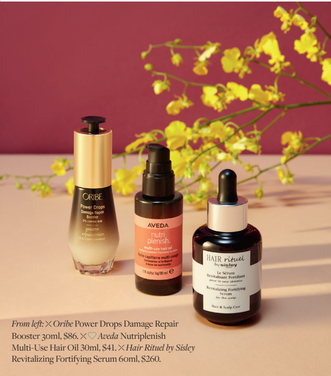
From left: ✕ Oribe Power Drops Damage Repair Booster 30ml, $86. ✕ Aveda Nutriplenish Multi-Use Hair Oil 30ml, $41. ✕ Hair Ritual by Sisley Revitalizing Fortifying Serum 60ml, $260.

For hair that looks as if it's been tended to by a professional, look to oils and serums with natural ingredients to gently nourish, fortify a weary scalp, or repair and protect.