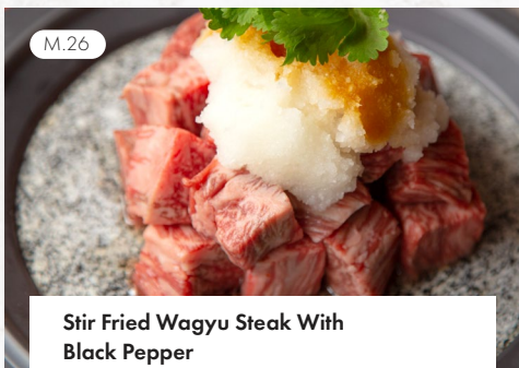
Stir Fried Wagyu Steak With Black Pepper 와규 큐브 스테이크 28.50