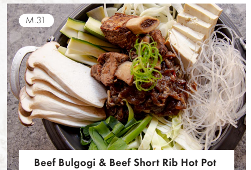
Beef Bulgogi & Beef Short Rib Hot Pot 소 불고기 & 갈비 전골 42.00 ★ SIGNATURE DISH