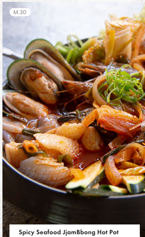
Spicy Seafood JjamBbong Hot Pot 해물짬뽕 46.00 🌶️🌶️ ★ SIGNATURE DISH