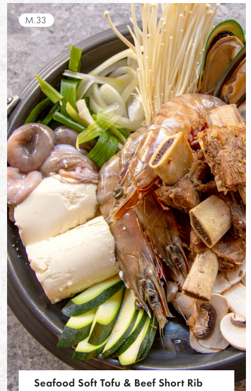
Seafood Soft Tofu & Beef Short Rib Hot Pot 해물 순두부 & 갈비 전골 46.00 🌶️