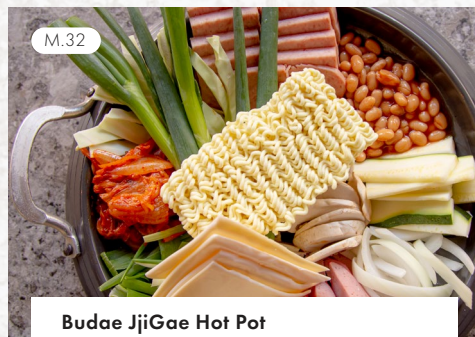
Budae JjiGae Hot Pot 부대 전골 42.00 ★ SIGNATURE DISH