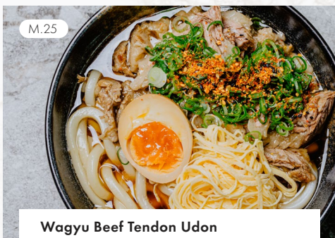
Wagyu Beef Tendon Udon 와규 쇠심줄 우동 / 牛筋うどん 18.50