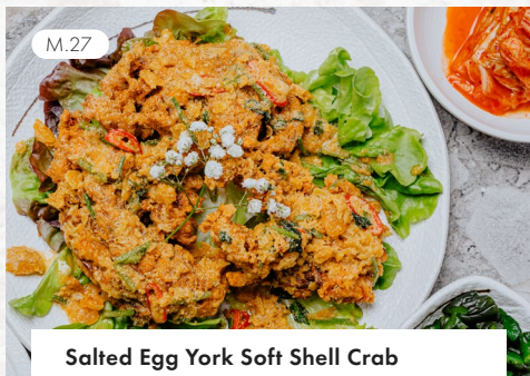
Salted Egg York Soft Shell Crab 35.00 (soft shell crab x 3) 28.00 (prawn) 24.00 (chicken)