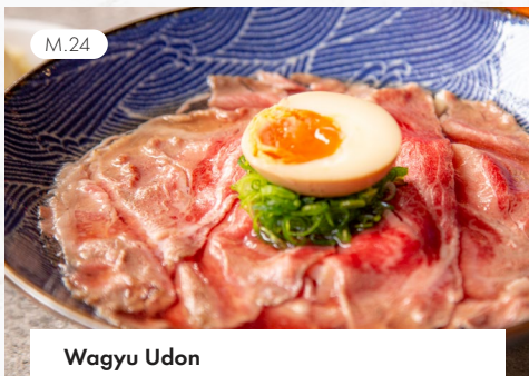
Wagyu Udon 와규 우동 / 和牛うどん 23.00