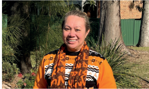
Sina Winterstein Lighthouse Community Support

Nicole Harcourt has helped over 500 women and their children move onto a happy and safe life since she established Sanctuary Housing in 2017. The mother-of-two funded the purpose-built shelter herself. Up to 40 women and children at a time can be accommodated, receiving meals, clothing and toys as well as dignity and respect.