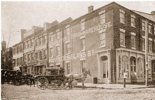
Stabler-Leadbeater Apothecary Museum