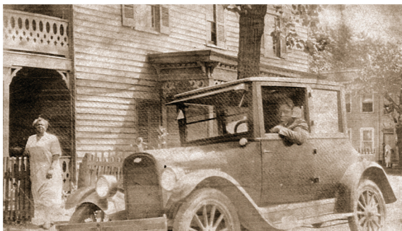
Home in Uptown Neighborhood, circa 1926

The Uptown neighborhood developed before the Civil War. By 1870, with many African Americans migrating to Alexandria during and after the War, Uptown grew into a large neighborhood. Many black churches developed here. The Parker-Gray historic district protects the historic structures in Uptown . The total area of Uptown is about 24 blocks, making it the largest of the historic African American neighborhoods in Alexandria.