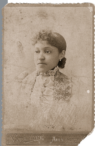
Alexandria Black History Museum