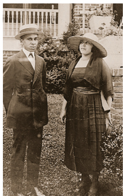
Visitors to the Fort Neighborhood, date unknown

The Fort neighborhood got its name because it occupied the property on and adjacent to Fort