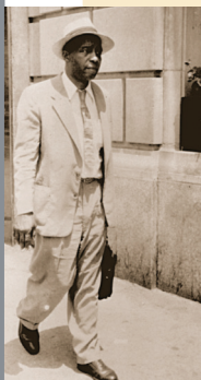
Alexandria Black History Museum