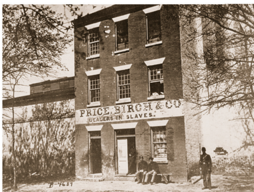
Alexandria Black History Museum

“We were first taken out into a paved yard 40 or 50 feet square, with a very high brick wall and about half of it covered with a roof. . . He (Armfield) ordered the men to be called out from the cellar where they sleep. . . they soon came up. . . 50 or 60. While they were standing, he ordered the girls to be called out. . . About 50 women and small children came in. . . and I thought I saw in the faces of these mothers some indication of irrepressible feeling. It seemed to me that they hugged their little ones more closely, and that a cold perspiration stood on their foreheads. . .”