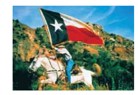
AMARILLO CONVENTION & VISITOR COUNCIL