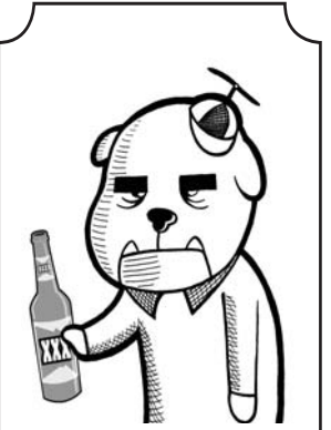
Uh-uh just drinks in Athens.