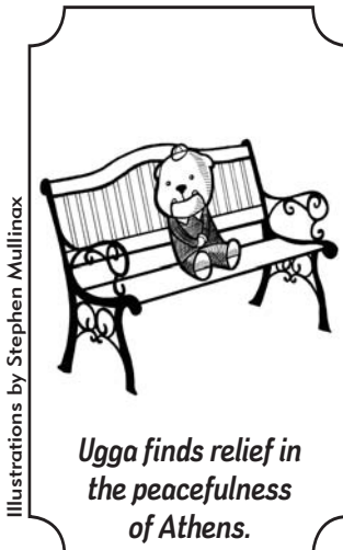
Ugga finds relief in the peacefulness of Athens.