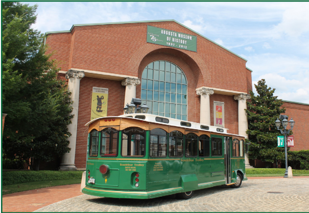
Climb aboard the Augusta Trolley