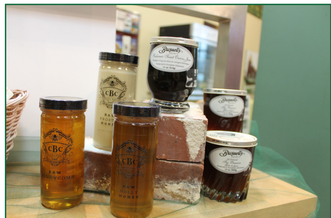
Capital Bee Honey available at the Augusta Visitor Center.

The Augusta Visitor Center has added new golf-themed gift items and Georgia-made products to enjoy in time for spring and Masters, our busiest season for welcoming guests. We invite both visitors and Augustans to shop our merchandise, including locally designed Augusta t-shirts, golf-themed wine bottle holders and business card and penholders. Georgia products like Capital Bee Honey from Savannah, Georgia Peanuts, and new jams, jellies, and pickles from across the Peach State make great foodie gifts and add a little Southern flair to any pantry.