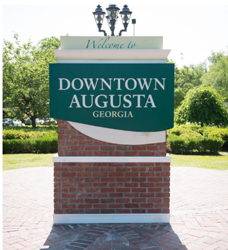
Augusta's Downtown Sign