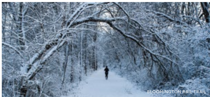
BLOOMINGTON RAIL TRAIL

W. Country Club Rd. and Church Ln.; 812-349-3700; bloomington.in.gov/parks