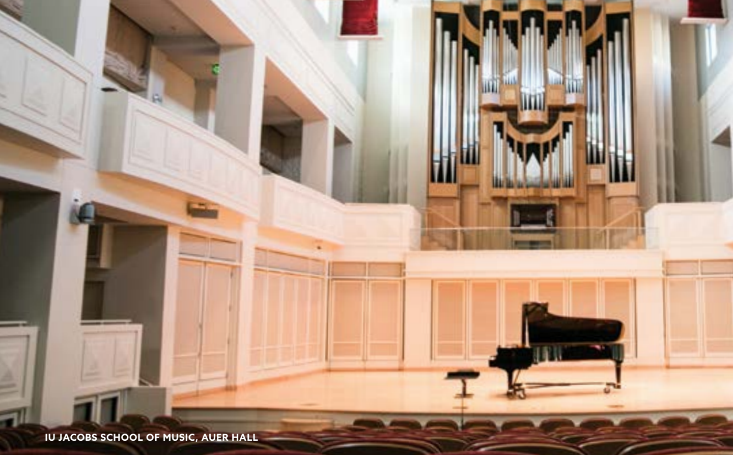
IU JACOBS SCHOOL OF MUSIC, AUER HALL