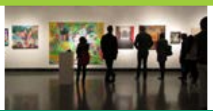
GRUNWALD GALLERY OF ART

For more information about these & other museums in Bloomington please go to visitbloomington.com/museums