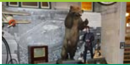
MONROE CO. HISTORY CENTER