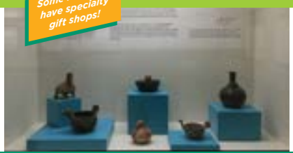
GLENN BLACK LABORATORY