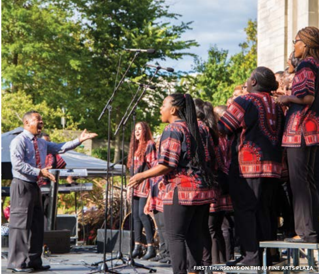
FIRST THURSDAYS ON THE IU FINE ARTS PLAZA