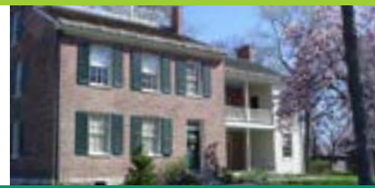
WYLIE HOUSE MUSEUM