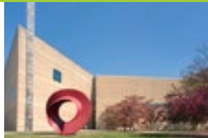
IU ESKENAZI MUSEUM OF ART