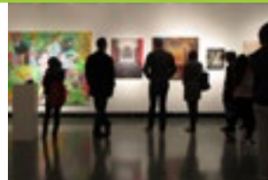
GRUNWALD GALLERY OF ART

For more information about these & other museums in Bloomington please go to visitbloomington.com/museums