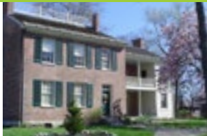
WYLIE HOUSE MUSEUM