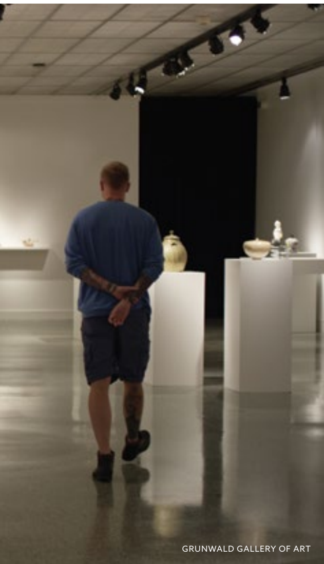
GRUNWALD GALLERY OF ART

Bringing you the best in local and national fine art and gifts. 114 S. Grant St.; 812-339-4200; thevenuebloomington.com