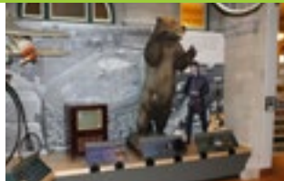
MONROE CO. HISTORY CENTER