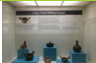
GLENN BLACK LABORATORY