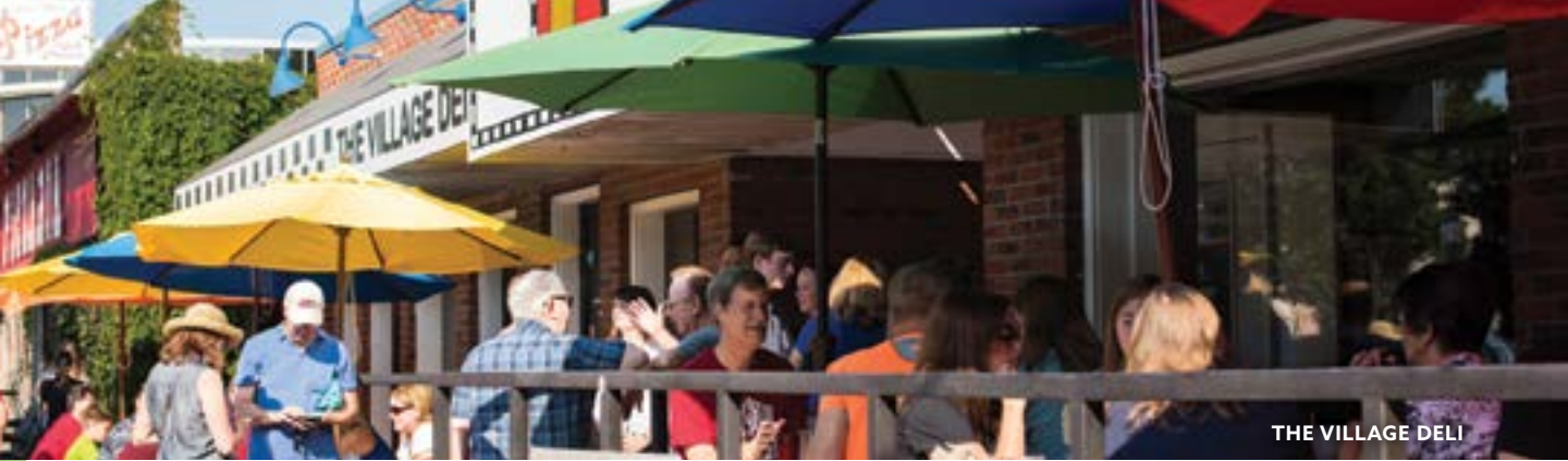
THE VILLAGE DELI