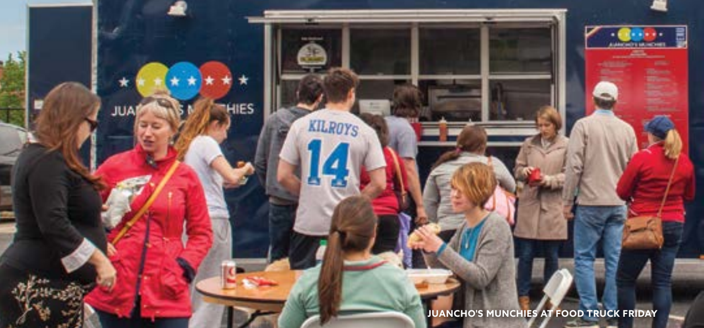
JUANCHO'S MUNCHIES AT FOOD TRUCK FRIDAY