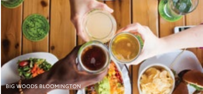
BIG WOODS BLOOMINGTON