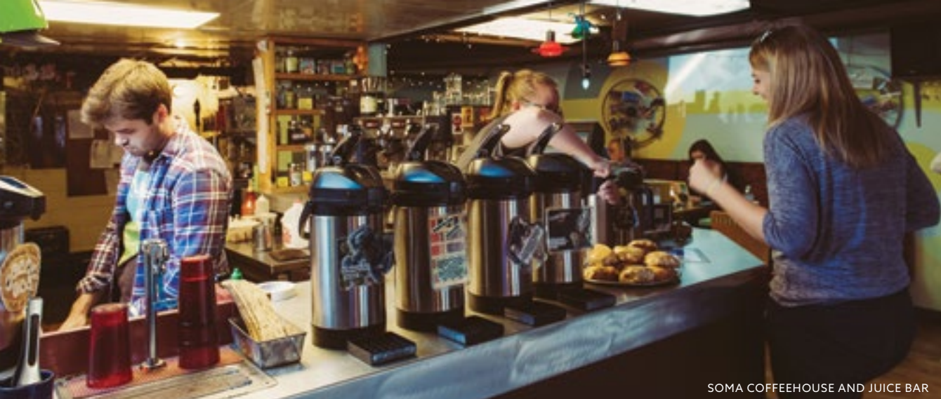
SOMA COFFEEHOUSE AND JUICE BAR