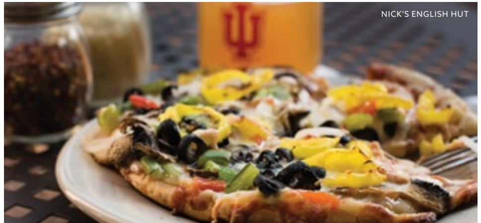
NICK'S ENGLISH HUT

Fresh brewed coffee, espresso drinks, hot chocolate, and pastries. 844-737-5246; barisgocoffee.com