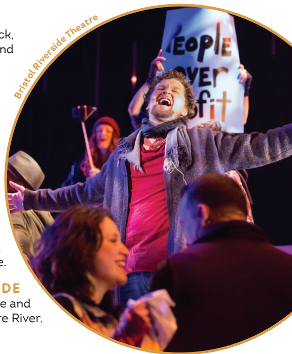
Bristol Riverside Theatre

Enjoy performances at the Bucks County Playhouse and Bristol Riverside Theatre along the Delaware River.