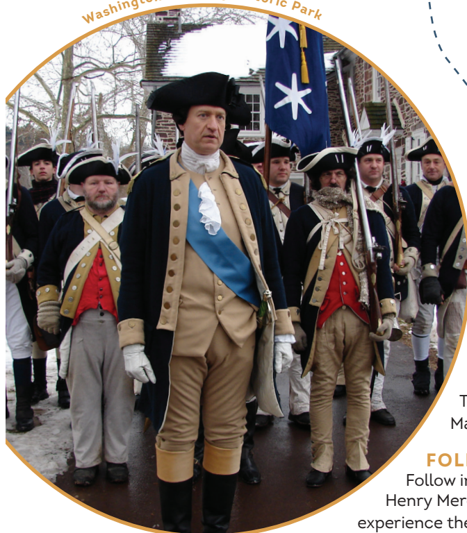
Washington Crossing Historic Park