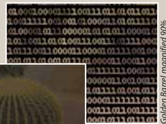
Golden Barrel, Marcus Zillcox

By Marcus Zillcox is a series of projected images from the City of Chandler compiled of binary code to create a streaming visual display in the lobby of the Information Technology Building at 275 E. Buffalo Street.