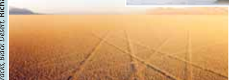
Tracks, Black Desert