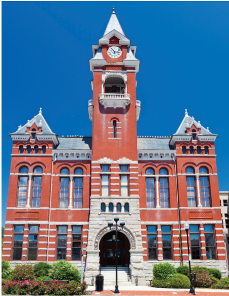
The county courthouse in Wilmington was featured on the TV show “Sleepy Hollow.”