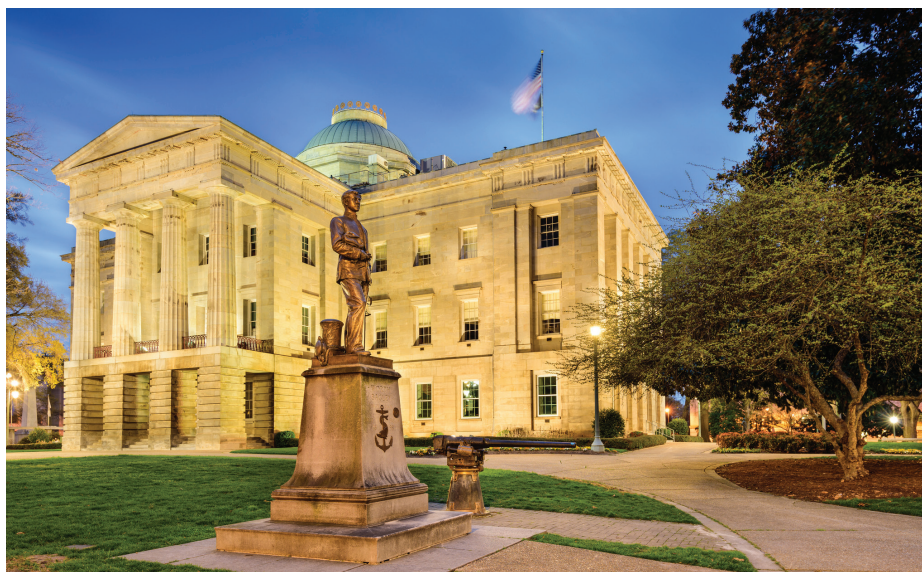
The North Carolina State Capitol in Raleigh is a National Historic Landmark that offers educational programs and a range of special events including concerts and exhibitions.

In the state capital of Raleigh , 10 universities and colleges provide event spaces for meetings, receptions and special events. At North Carolina State, the McKimmon Conference & Training Center hosts an average of 2,000 events annually. The hub for most meetings is the 500,000-square-foot, silver LEED-certified Raleigh Convention Center. A few blocks away, the Duke Energy Center for the Performing Arts has more than a half-dozen venues including the