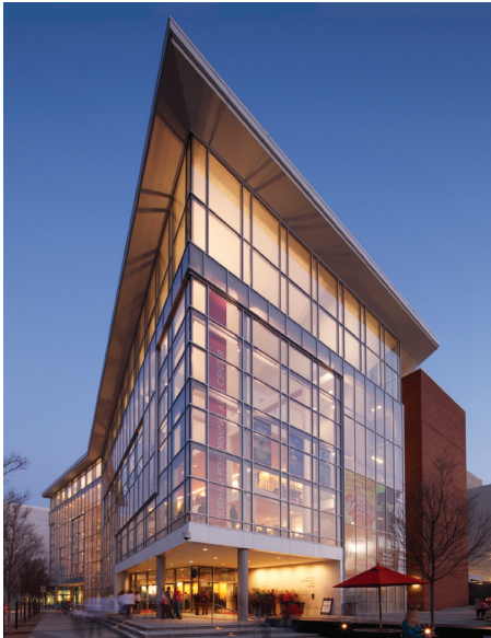
The Durham Performing Arts Center can accommodate groups of up to 2,000.