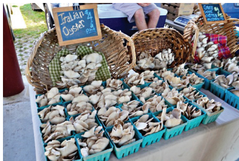
The Carrboro Farmers' Market.