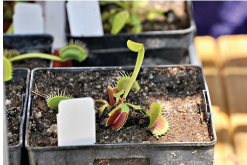
Who knew that Venus Fly Traps were native to North Carolina?

Drop by the Carrboro Farmers' Market for the freshest locally grown produce, prepared foods, flowers, and crafts, all from within a 50-mile radius. This is considered one of the top markets in the South. Art and craft lovers will appreciate the workmanship of local artisans at the North Carolina Crafts Gallery. Another place to see artwork, as well as typical shopping boutiques, is at the huge Carr Mill Mall. The mall is even listed on the National Register of Historic Places. Here you will find fashions, toys, outdoor apparel, jewelry, gifts, and home furnishings. It really is a great place to browse, plus a perfect rainy day option.