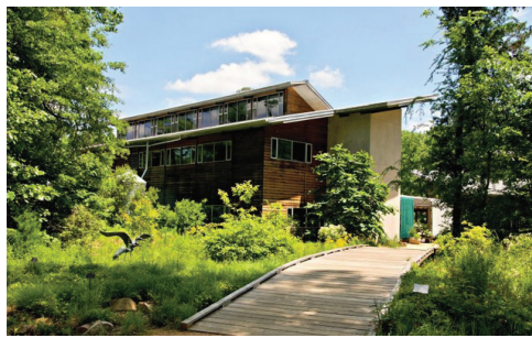
The North Carolina Botanical Garden.

Get in touch with nature at the North Carolina Botanical Garden, one of the best collections of regional plants in the state. You won't want to miss the Pitcher Plants and Carolina Birds-in-a-Nest, two eye-catching plants that I was unfamiliar with. The botanical garden also has a large collection of Venus Fly Traps, which are grown right here in North Carolina.