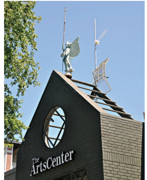
The Artscenter is Carrboro's #1 most-visited attraction.

Carrboro's music scene is one you definitely need to check out. Cat's Cradle is the venue to do just that. In fact, it has been both Carrboro and Chapel Hill's premier music venue for over 40 years. Music giants such as John Mayer, Public Enemy, Joan Baez, and even Nirvana have graced their stage at some point. The intimate setting only holds 750 guests.