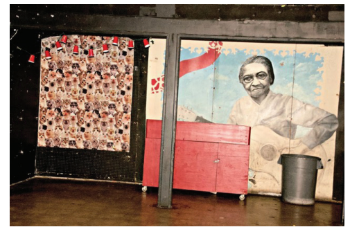
Eating and buying local are popular in Carrboro.

Carrboro's music scene is one you definitely need to check out. Cat's Cradle is the venue to do just that. In fact, it has been both Carrboro and Chapel Hill's premier music venue for over 40 years. Music giants such as John Mayer, Public Enemy, Joan Baez, and even Nirvana have graced their stage at some point. The intimate setting only holds 750 guests.