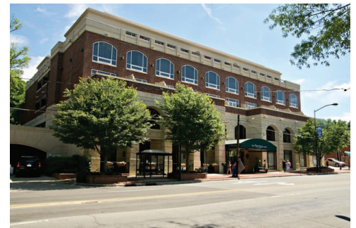
Dining at Tandem is truly an experience for your mouth and senses.

There are plenty of chain hotels in the Carrboro/Chapel Hill area including the new Hampton Inn & Suites, Hyatt Place Chapel Hill, and the upscale Franklin Hotel (in the Curio Collection by Hilton). The latter two offer free Wi-Fi, a local shuttle service, and free parking. Carolina Inn is an iconic Chapel Hill hotel offering impeccable service, elegant decor, and luxurious accommodations, since 1924. Crossroads, their onsite restaurant, offers both indoor and outdoor dining. Take your afternoon tea in the lobby, dining room, or garden terrace as you enjoy this Southern tradition of tea sandwiches, sweets, scones, and of course, assorted teas. There are both indoor and outdoor pools.