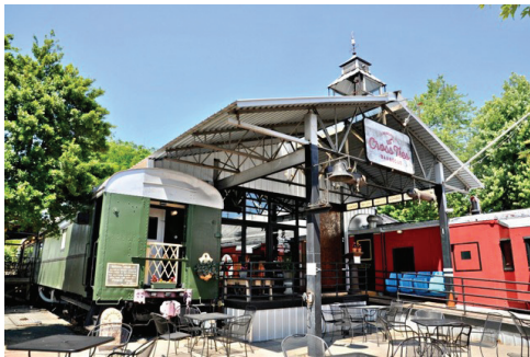
Kids will love that you dine in retro train cars at Cross Ties Barbecue, featuring North Carolina's favorite dish.

Cross Ties Barbecue is where you can get your NC barbecue grub on, along with scratch-made sides (fried deviled eggs, pickled vegetables, hush puppies, smoked gouda mac and cheese... oh my!) and creative appetizers while dining in restored train cars. Steel String and Yester Years Breweries will satisfy your craft beer desires.