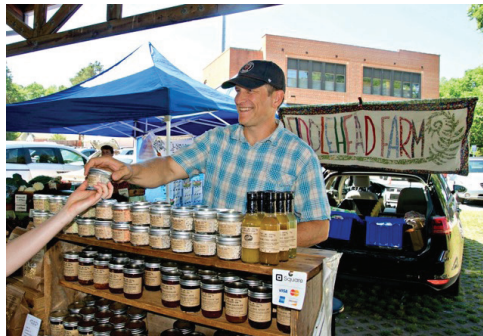
The Carrboro Farmers' Market has been selling local produce and foods since 1979.

Drop by the Carrboro Farmers' Market for the freshest locally grown produce, prepared foods, flowers, and crafts, all from within a 50-mile radius. This is considered one of the top markets in the South. Art and craft lovers will appreciate the workmanship of local artisans at the North Carolina Crafts Gallery. Another place to see artwork, as well as typical shopping boutiques, is at the huge Carr Mill Mall. The mall is even listed on the National Register of Historic Places. Here you will find fashions, toys, outdoor apparel, jewelry, gifts, and home furnishings. It really is a great place to browse, plus a perfect rainy day option.