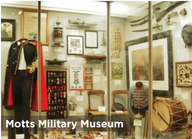
Motts Military Museum

Morning | Visit the Motts Military Museum , dedicated to preserving the memory of all individuals that served in the United States military. Lunch | Head out to lunch at The 94th Aero Squadron , a themed restaurant full of military memorabilia and aviation relics depicting the times of the WWI and WWII eras. The restaurant, which once was a French Farmhouse, is located between the runways of the John Glenn Columbus International Airport and offers a dramatic view of the arriving and departing traffic. Afternoon | Take a personally-guided factory tour at American Whistle Corporation , the ONLY manufacturer of metal whistles in the United States. Everyone leaves with a shiny new “American Classic” whistle. Spend the rest of the day in Old Worthington , a historic neighborhood founded in 1803 by New England settlers. Stroll the sidewalks of Worthington to see many of the original noteworthy buildings and churches still standing proudly. Then, pick from hundreds of fragrances before pouring your own custom-scented candle at The Candle Lab . Or make your own greeting card on an antique printing press at Igloo Letterpress .