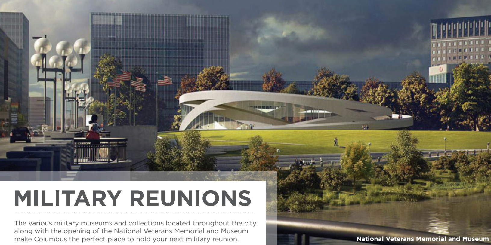
National Veterans Memorial and Museum