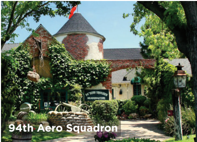
94th Aero Squadron