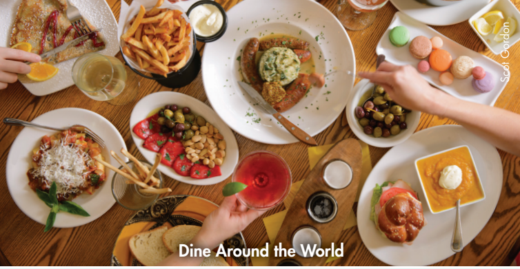
Dine Around the World