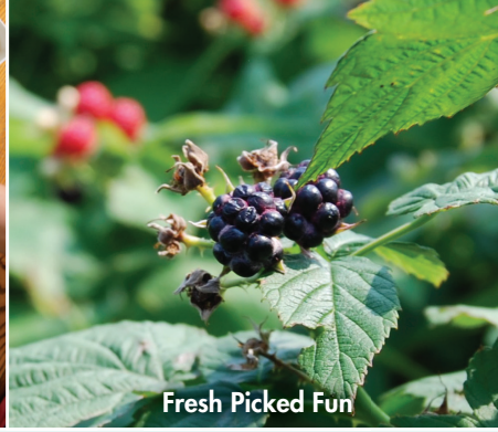
Fresh Picked Fun