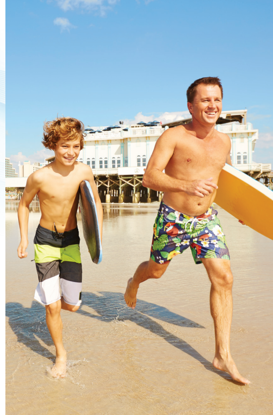
Surfers at Daytona Beach.

Explore more of Daytona Beach's hidden gems at daytonabeach.com .