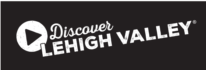
Discover LV Logo-WHITE-FINAL.eps