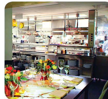
2941 restaurant's "chef's table"

PASSIONFISH: The bar at this seafood spot allows you to sip saketini's, dive into oysters and people watch.