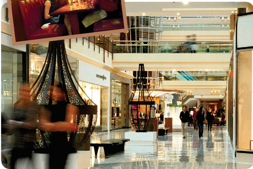
Sweetwater Tavern, Tysons Galleria