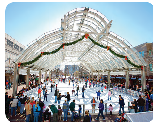
Reston Town Center

Let your taste buds start their epicurean travels with Italian and swing into Dante Ristorante, located in a charming home originally built in 1889. Relax on the patio while dining on traditional Italian fare like lamb osso buco, risotto and homemade pasta. For hearty Alsatian-French cuisine, settle into