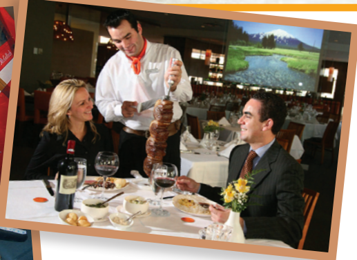
From left: Smithsonian's National Air and Space Museum Steven F. Udvar-Hazy Center, Chima Brazilian Steakhouse

Great Falls National Park, farmers market, Lorton Workhouse Arts Center