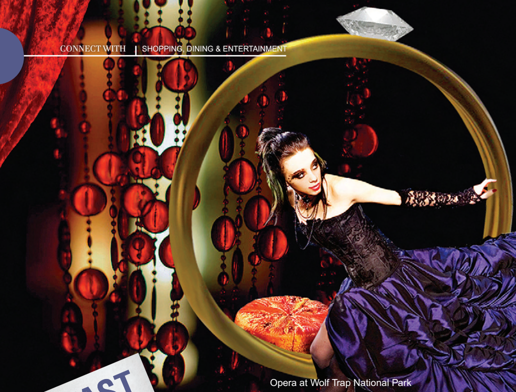
Opera at Wolf Trap National Park