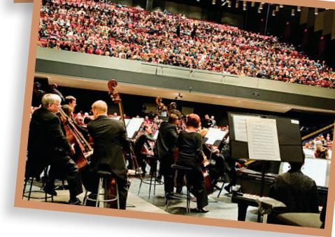
Picnicking at Wolf Trap, George Mason University's Center for the Arts

Across the street, Tysons Galleria puts a luxurious sheen on things with stores like Bose, Chanel, Versace and Stuart Weitzman. The Shops at Fairfax Square offer lavish choices like Hermes, Louis Vuitton, Gucci and Tiffany & Co. Less than 10 miles away, Reston Town Center allows shoppers to stroll along brick-lined streets and pop into J. Crew, Nine West, Talbots, Williams-Sonoma and more.