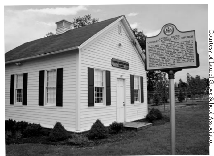
#42 Laurel Grove School