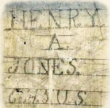
The Shenandoah Valley Civil War Museum

The Frederick County Court House in Winchester, built in 1840, served as a prison, hospital, and barracks for both sides during the Civil War. Soldiers wrote their names and drew pictures on the walls, some of which can still be seen. The building now houses the Shenandoah Valley Civil War Museum, which features the restored court room, a nationally recognized collection of relics, and exhibits that tell the story of the Civil War era in the Shenandoah Valley – and of the graffiti on the walls.