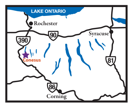
GPS Coordinates 42.7148, -77.7123

Adventurous paddlers looking for a full day's paddle may also park at the DEC fisherman's access off Pebble Beach Road on the north end of the lake and traverse its length to and from the WMA.