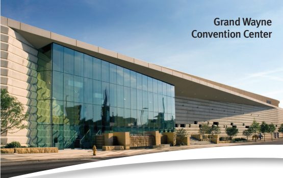
Grand Wayne Convention Center