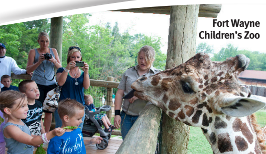
Fort Wayne Children's Zoo

Your group will enjoy this winning package as a memorable part of their experience!