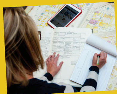
DISCOVER YOUR ROOTS