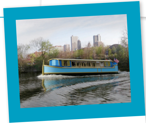
RIVERFRONT FORT WAYNE