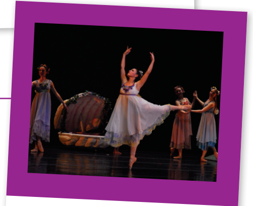
DOWNTOWN ARTS CAMPUS