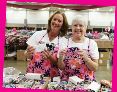
VERA BRADLEY OUTLET SALE