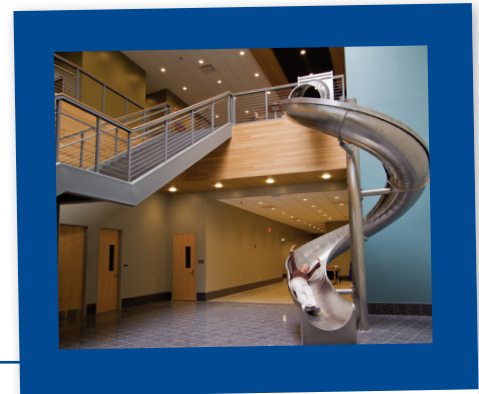
A MUSIC LOVER'S PLAYGROUND

Discover a different vantage point of Fort Wayne, from our riverfront where you can learn about our rich history, take a tour on a 19th Century replica canal boat or an amphibious "duck" boat, and enjoy plenty of fun activities on the water.