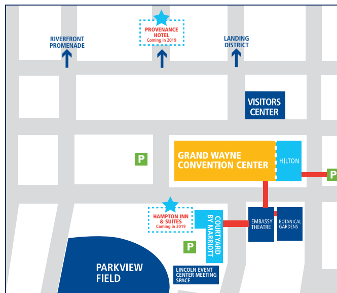
Downtown Fort Wayne: connected and convenient