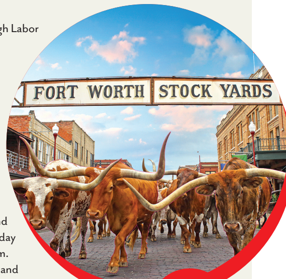
The Fort Worth HERD

Memorial Day through Labor Day, adults and children experience hands-on activities such as roping, saddling, cattle drive demonstrations and chuck wagon stories from the Fort Worth Herd.