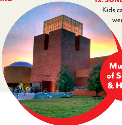
Museum of Science & History

Three museums in one, families will enjoy five permanent exhibits. Crawl around a massive sandbox for fossils in the Dino Lab exhibit or explore light and color in the Designer Studio. Watch a show at the Omni Theater (an IMAX dome) or catch a star party at the Noble Planetarium.