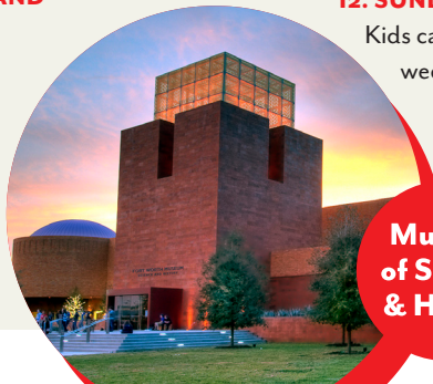
Museum of Science & History

Three museums in one, families will enjoy five permanent exhibits. Crawl around a massive sandbox for fossils in the Dino Lab exhibit or explore light and color in the Designer Studio. Watch a show at the Omni Theater (an IMAX dome) or catch a star party at the Noble Planetarium.