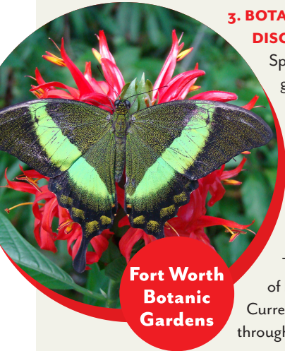
Fort Worth Botanic Gardens

Spend some time in the 22 specialized gardens while learning about 2,500 species of plants. Family Discover Day takes place each month in the vegetable garden.