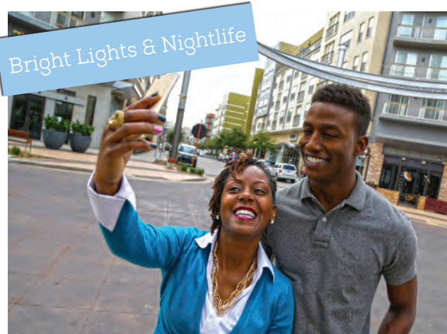
Bright Lights & Nightlife

Once home to cowboys, cattlemen and outlaws, today the Stockyards National Historic District is one of the most popular attractions in Texas. Visitors come to the Stockyards to get a taste of the true American West. See The Fort Worth Herd , the world's only twice-daily cattle drive, at 11:30 a.m. and 4 p.m. Enjoy horseback riding along the Trinity Trails . Take in a concert and two-step at Billy Bob's Texas , the world's largest honky-tonk, or attend the Stockyards Championship Rodeo every Friday and Saturday night. Begin your journey on Exchange Avenue, where the weathered brick streets are lined with historic buildings, restaurants, shops, saloons and a sense of the Old West.