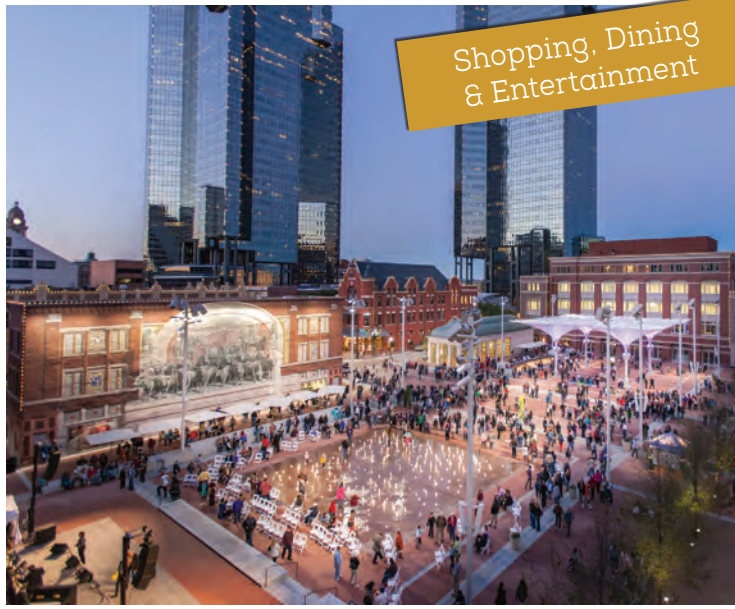
Shopping, Dining & Entertainment