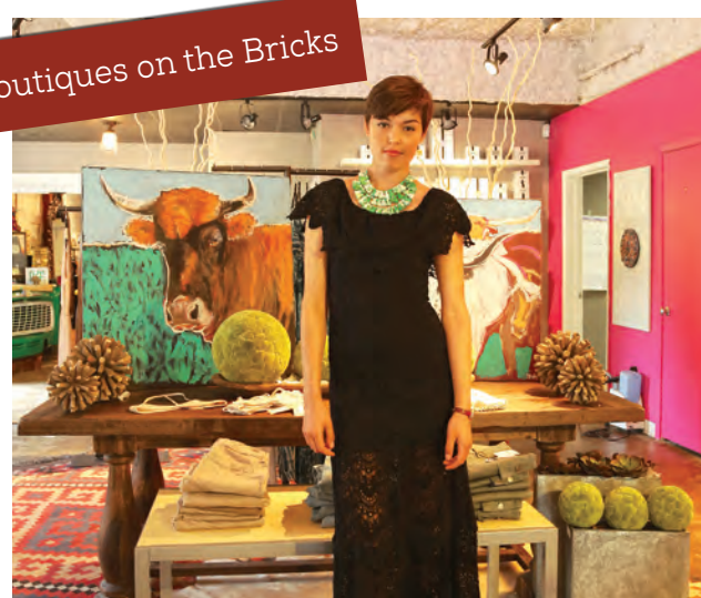
Boutiques on the Bricks