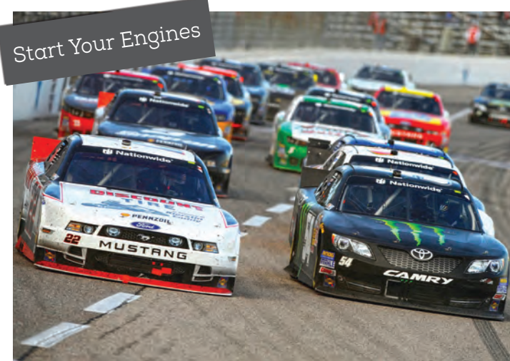
Start Your Engines

This is one of the most historic neighborhoods in Fort Worth, offering 30-blocks of restaurants and stores, including some of the finest specialty boutiques in the city. To see it all, you'll want to drive, park and explore: it stretches nine miles from the Fort Worth Cultural District to Highway 820. Once home to a World War II military training camp, Camp Bowie today is a tree-lined thoroughfare with charming neighborhoods, pocket parks, trendy shops and casual dining. The boulevard is divided into three main sections: The Bricks, Ridglea and Camp Bowie West .