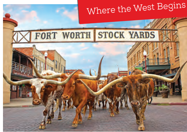
Where the West Begins

The Fort Worth Zoo , recently named one of the Top 5 in the Nation, is home to more than 7,000 native and exotic animals and several indoor and outdoor exhibits that provide an entire day of fun for all ages. During the summer, kids can cool off at the Fort Worth Zoo's Safari Splash water play area. Nearby Texas Christian University (TCU) is one of the most picturesque and prominent small universities in the United States. Explore the campus on foot, then spend some time in the neighborhood along Berry Street and University Drive to experience a part of Fort Worth with a flavor all its own.