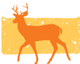
WHITE TAILED DEER Odocoileus virginianus