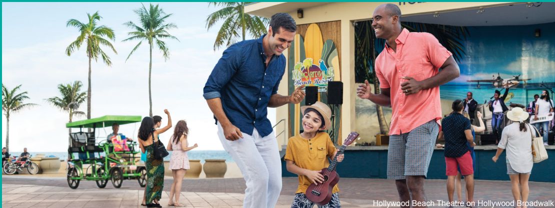
Hollywood Beach Theatre on Hollywood Broadwalk

Day or night, there's always something sunny going on. From concerts at BB&T Center and Hard Rock Event Center to arts and cultural festivals year-round, plus sporting events, watersports, nightlife and underground scene. Your Greater Fort Lauderdale experience can be as busy as you wish! Save time (and room in your suitcase) for a great find at a local boutique, upscale department store or designer outlet.