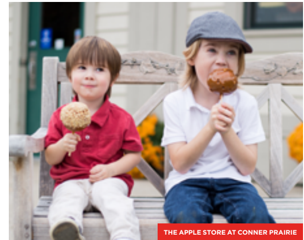
THE APPLE STORE AT CONNER PRAIRIE

ST. YARED ETHIOPIAN CUISINE & COFFEEHAUS 11210 Fall Creek Rd., Indianapolis 317.363.4435 StYaredCuisine.com $ ● ● ● ● ● ● ● ●