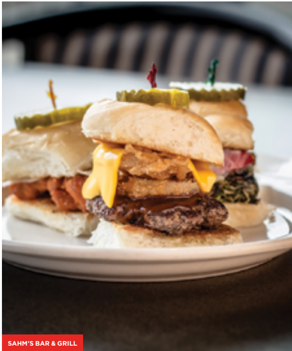
SAHM'S BAR &amp; GRILL

LOUVINO 8626 E. 116th St. 317.598.5160 LouVino.com/Fishers $$ ● ● ●