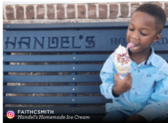
FAITHCSMITH Handel's Homemade Ice Cream