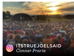
ITSTRUEJOELSAID Conner Prairie