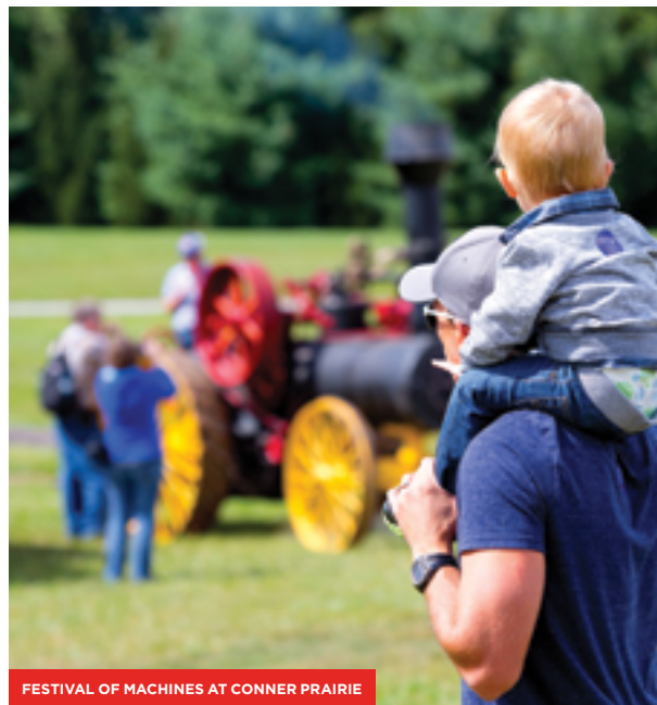
FESTIVAL OF MACHINES AT CONNER PRAIRIE