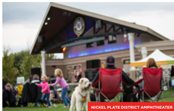
NICKEL PLATE DISTRICT AMPHITHEATER

When Conner Prairie's outdoor experience areas shut down for the evening, concerts on the Prairie are just beginning. The amphitheater-style venue