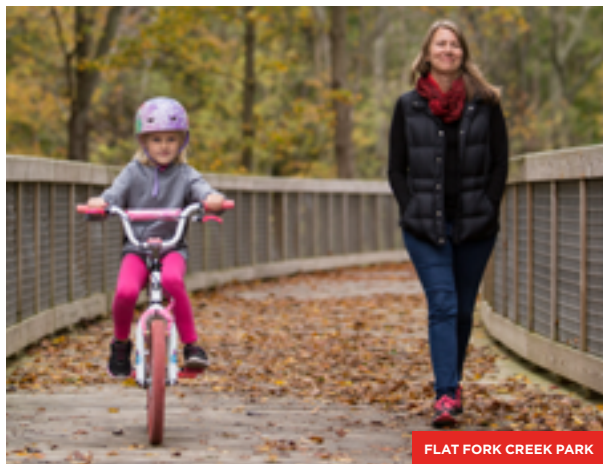
FLAT FORK CREEK PARK

A winding trail for avid runners and cyclists surrounds the 20-acre lake located in the heart of Saxony. The lake is fully stocked with fish and also boasts a wildly popular beach.