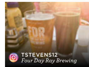
TSTEVEN12 Four Day Ray Brewing