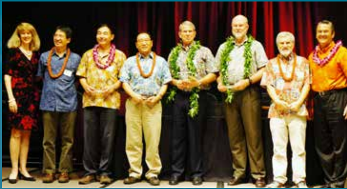
SOEST faculty recognized for their support of the 2018 Asia Oceania Geosciences Society booking.