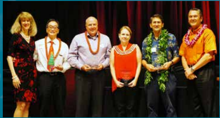
Hawaii Medical Association physicians who rescued Hawaii's American Medical Association bookings.