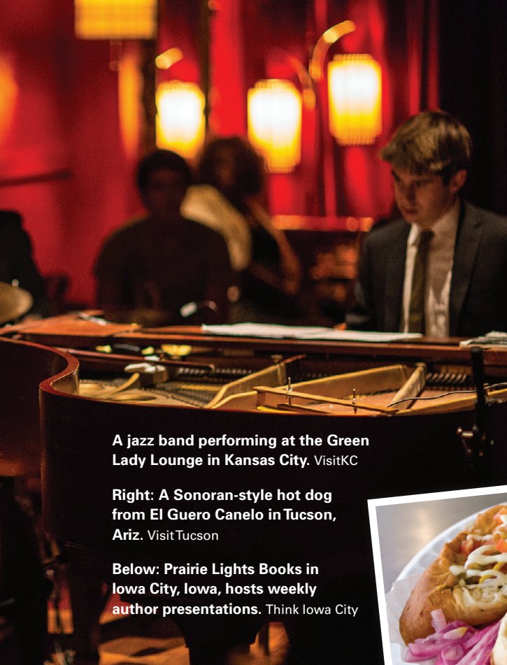
A jazz band performing at the Green Lady Lounge in Kansas City.