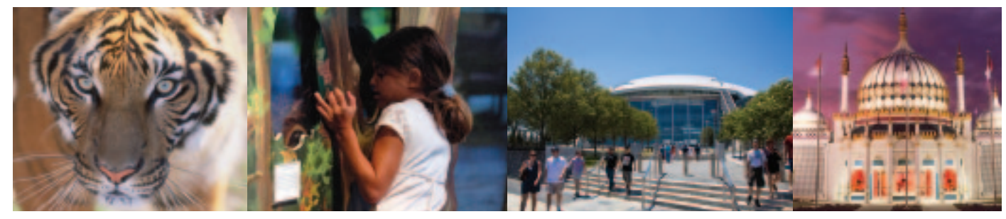
L > R | Fort Worth Zoo, River Legacy Park Living Science Center