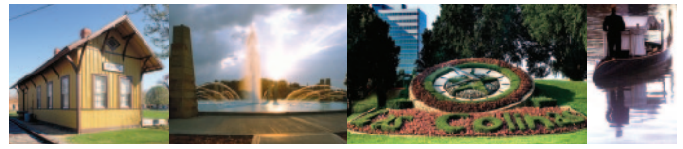
L > R | Heritage Park, Millennium Fountain