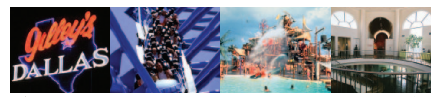
L > R | Gilley's Dallas, Six Flags Over Texas