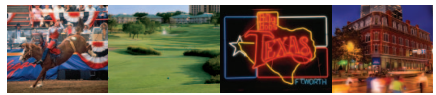
L > R | Mesquite Championship Rodeo, TPC Golf Course