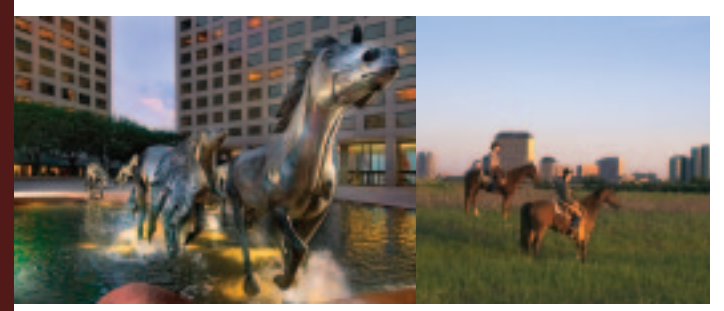
Mustangs of Las Colinas, Irving Skyline | L > R

Irving, Texas will capture your fancy with its easy-going spirit and exceptional opportunities for recreation and relaxation. Whatever your ideal leisure activity, you'll find it here or near.