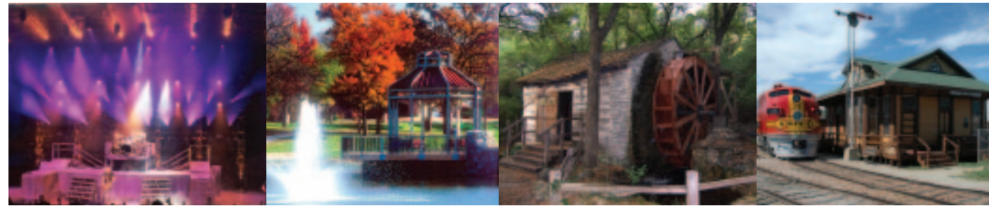
L>R | Verizon Theatre at Grand Prairie, Irving Heritage District