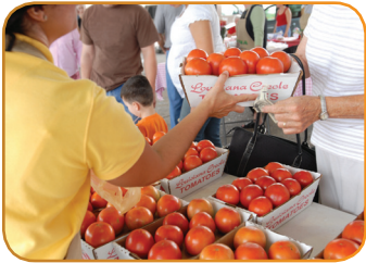
Farmers & Fisheries Market