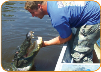
Louisiana Swamp Tour