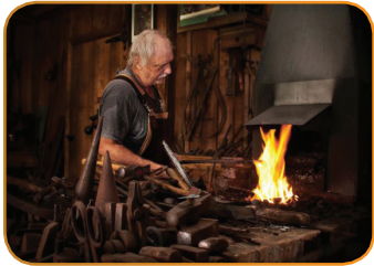
Historic Gretna blacksmith

Sala Avenue is the city’s Historic District and is currently being redeveloped for the enjoyment of locals and visitors. The long awaited Westwego Farmers and Fisheries Market, opened summer 2008, features fresh produce, seafood, arts and crafts Wednesday and Saturday from 9am to 1pm. The Westwego Historic Museum is located in the century-old fisherman’s exchange building and features an old time hardware store and completely furnished upstairs living quarters with antique furniture.