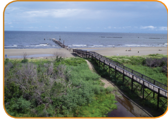
Grand Isle Beach