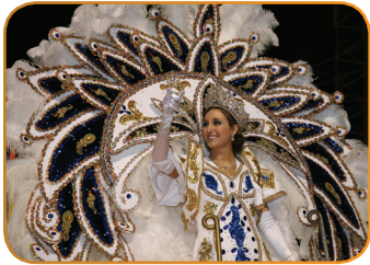
Mardi Gras Queen

* To request any pictured images or additional images of Jefferson for media use, please visit our website’s video/photo tour section at www.experiencejefferson.com/media/photos/