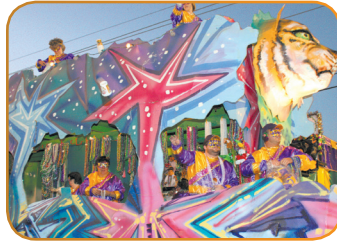
Louisiana Mardi Gras