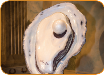
Lafitte Oyster Sculpture

A Jefferson Parish public art program showcasing supreme oyster eateries paired with a 3-foot oyster sculpture hand painted by a local artist.