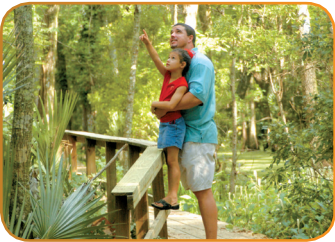
Jean Lafitte National Park

Boardwalks over the swamp get you up close & personal with nature in all its glory.