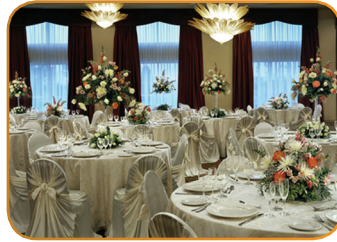
Small Intimate Venues