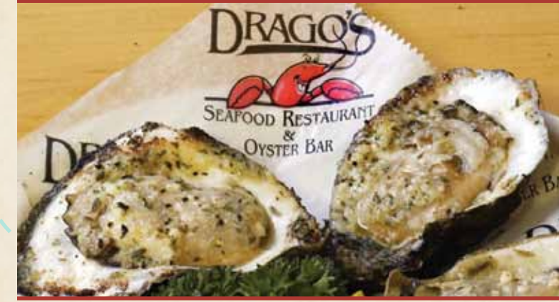
Charbroiled Oysters, Drago's Seafood Restaurant & Oyster Bar