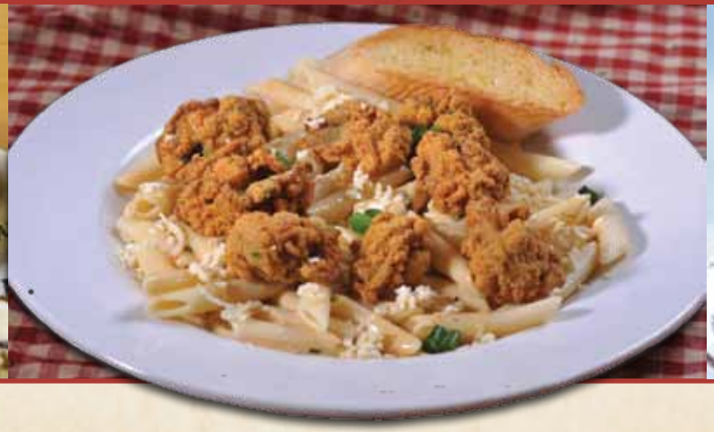
Oysters Acadiana, O'Henry's Food & Spirits