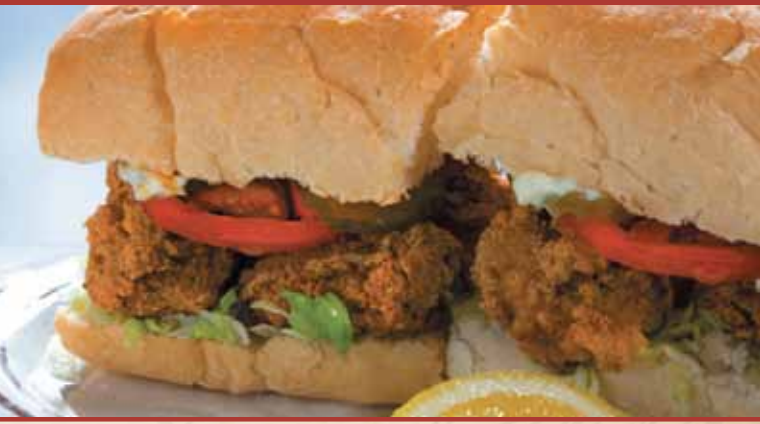
Fried Oyster Po-boy, Acme Oyster House