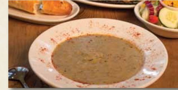
Oyster & Rockefeller Soup, Deanie's Seafood Restaurant

Oyster season is during months that end in -R (September - December).