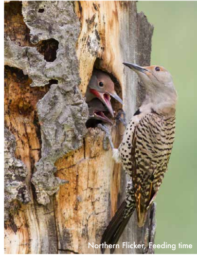
Northern Flicker, Feeding time