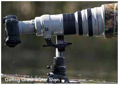
Getting Great Water Shots