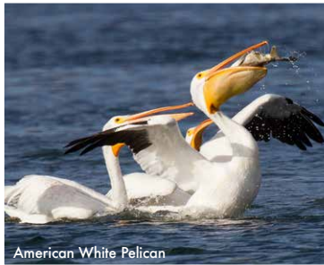
American White Pelican