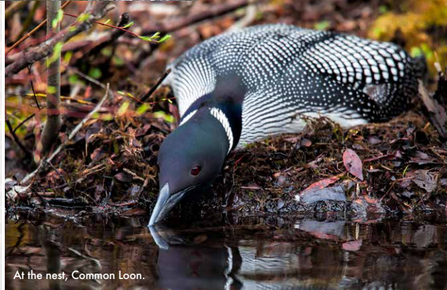
At the nest, Common Loon.