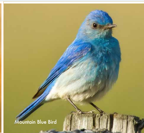
Mountain Blue Bird