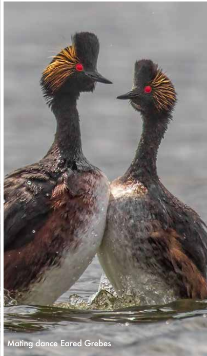
Mating dance Eared Grebes