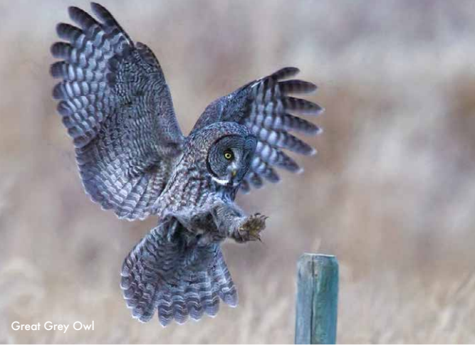
Great Grey Owl