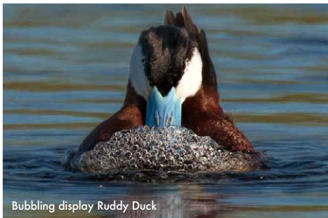
Bubbling display Ruddy Duck