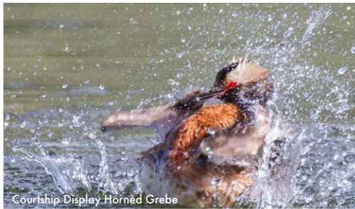
Courtship Display Horned Grebe