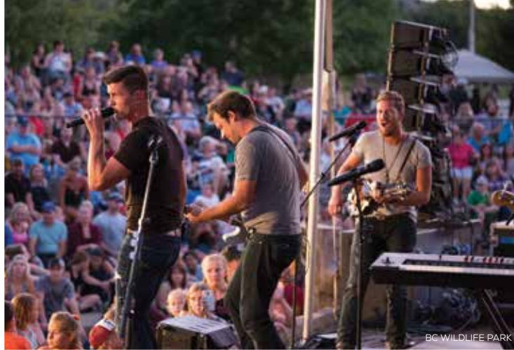
BC WILDLIFE PARK