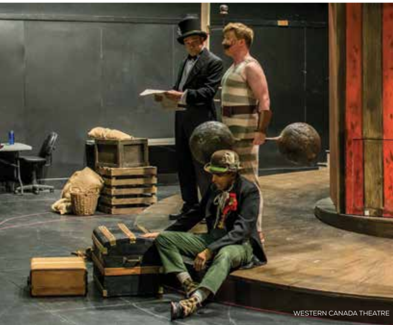
WESTERN CANADA THEATRE