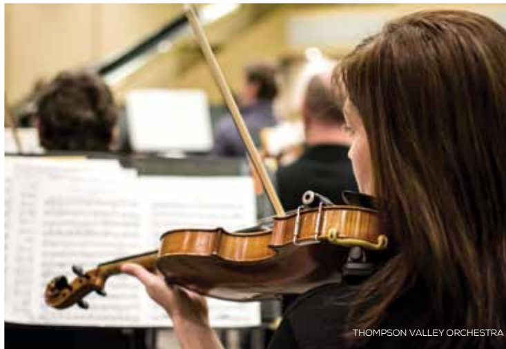
THOMPSON VALLEY ORCHESTRA