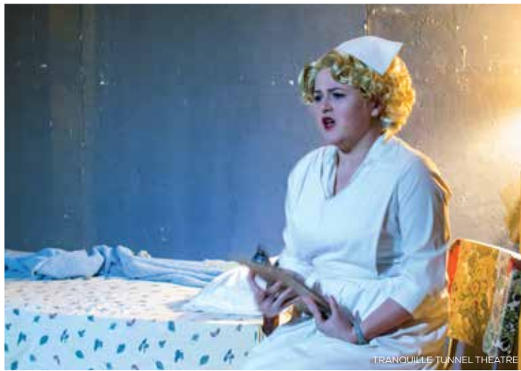
TRANQUILLE TUNNEL THEATRE