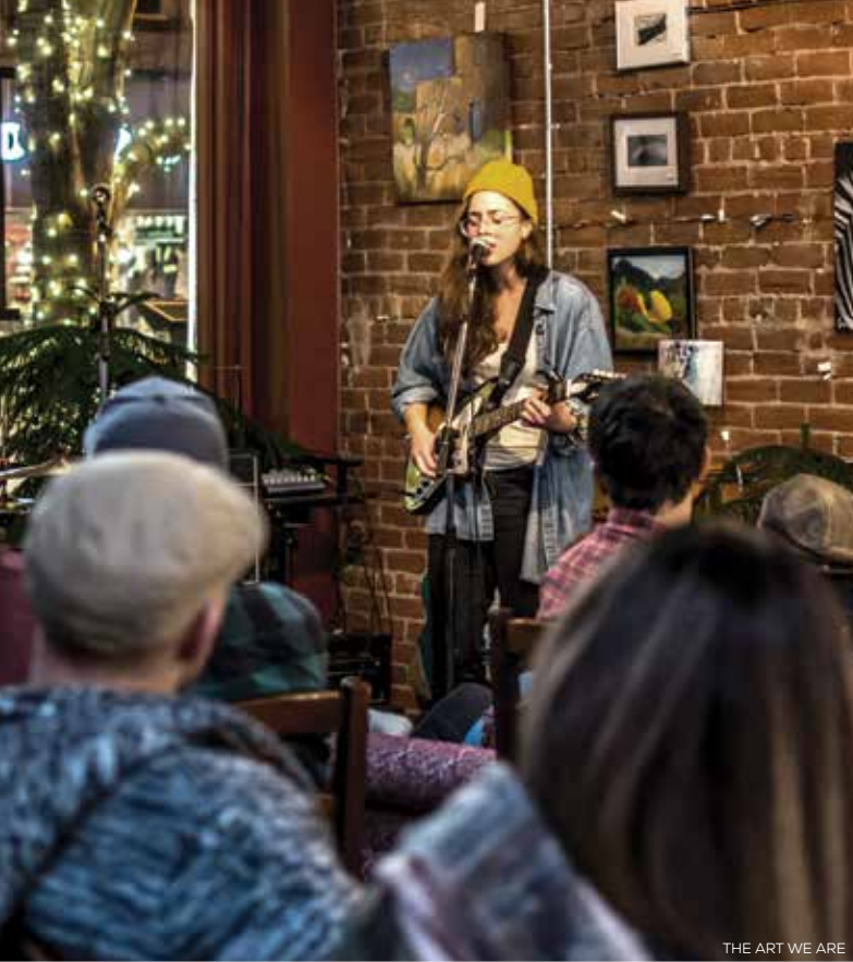
THE ART WE ARE