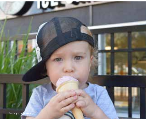
Scoopz Ice Cream