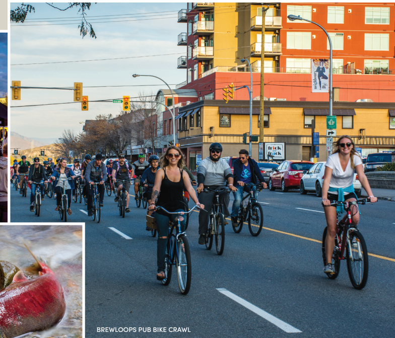
BREWLOOPS PUB BIKE CRAWL