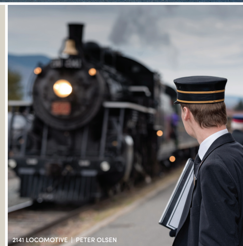
2141 LOCOMOTIVE | PETER OLSEN

If you're looking for a family escape, Clover the Spirit Bear at the BC Wildlife Park is great start. Or, if some adrenaline is up your alley the 100-foot descent on Treetop Flyer's Screaming Eagle Swing will get the blood pumping. Families love Riverside Park all year round, but summertime is the best for splashing in the kids waterpark, taking in Music in the Park (a free nightly concert in July and August) and soaking up the crimson sunset along the Rivers Trail bordering the Thompson River. The ultimate summer celebration happens during the second weekend in August with Ribfest and Hot Nite in the City. Check out the vintage car show and shine during the day and indulge in sticky BBQ'd ribs in the evening summer warmth. Live music and a kids fun zone make this the perfect family hangout. The 2141 Spirit of Kamloops steam locomotive is a great option for history buffs and kids of all ages - one of the only steam engines left in its kind.