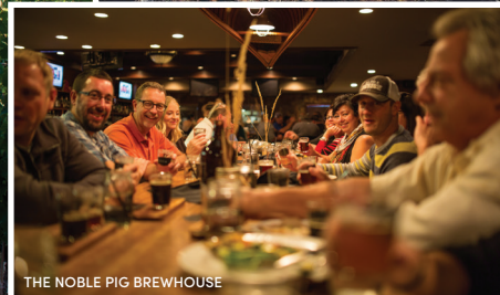
THE NOBLE PIG BREWHOUSE