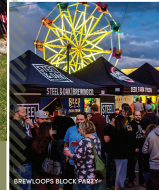
BREWLOOPS BLOCK PARTY