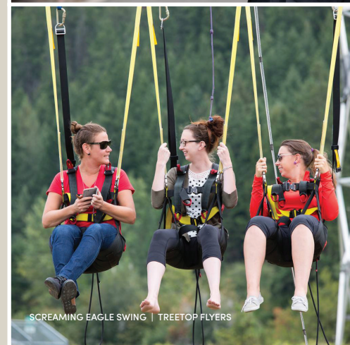
SCREAMING EAGLE SWING | TREETOP FLYERS