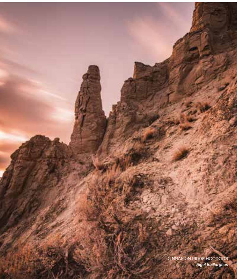
CINNAMON RIDGE HOODOOS Nigel Baillargeon