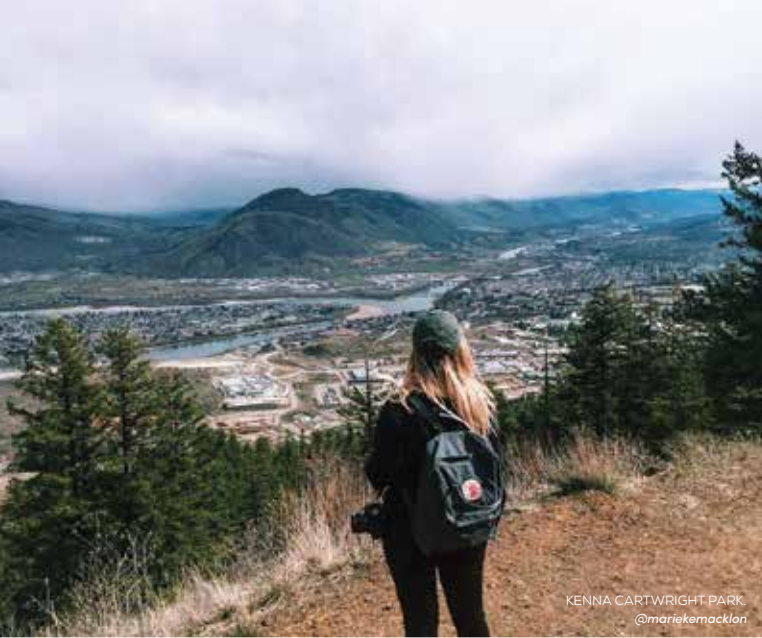
KENNA CARTWRIGHT PARK @mariekemacklon