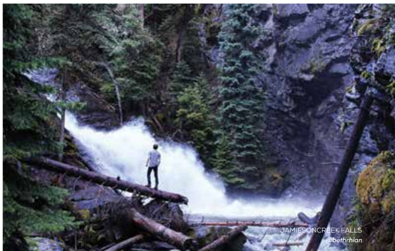
JAMIESON CREEK FALLS