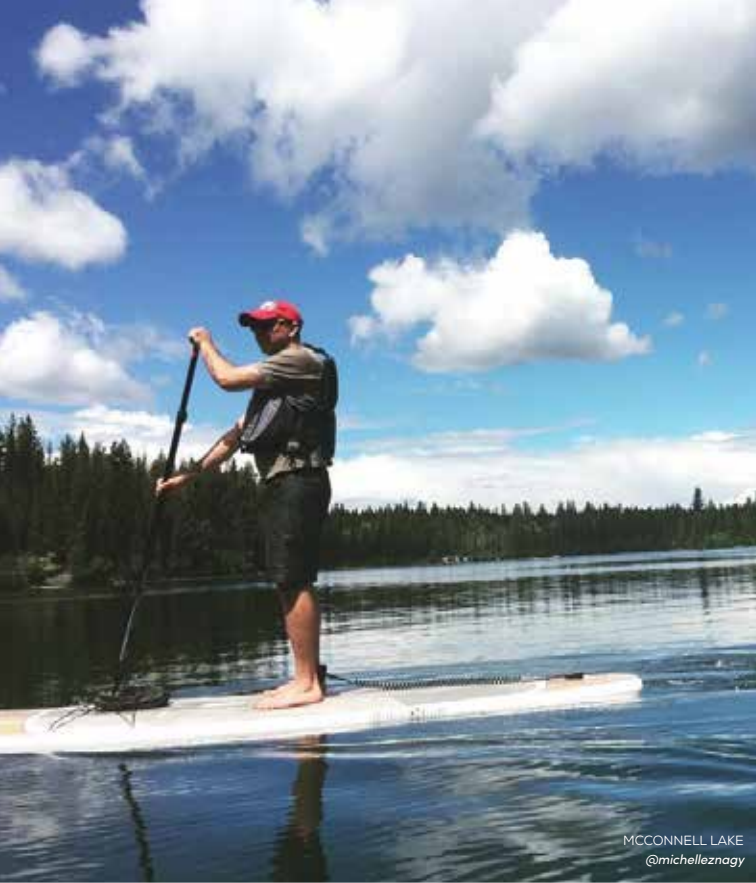
MCCONNELL LAKE @michelleznagy