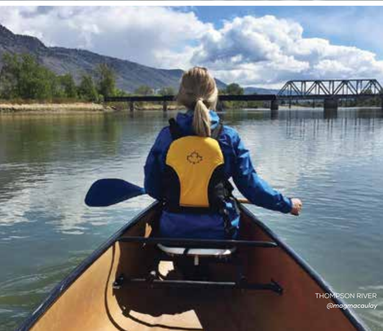
THOMPSON RIVER