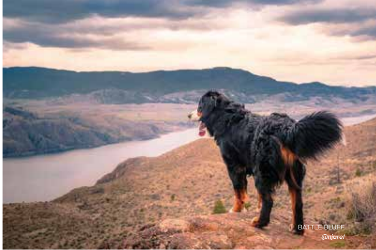
BATTLE BLUFF @njaret