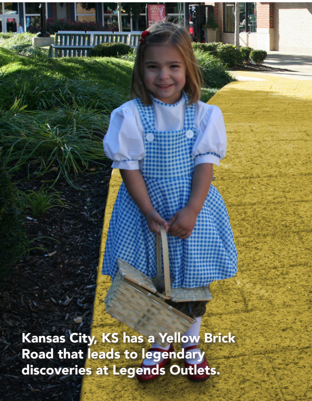
Kansas City, KS has a Yellow Brick Road that leads to legendary discoveries at Legends Outlets.

The highest Rooftop Patio in Kansas City, Kansas is at Dave & Buster's.