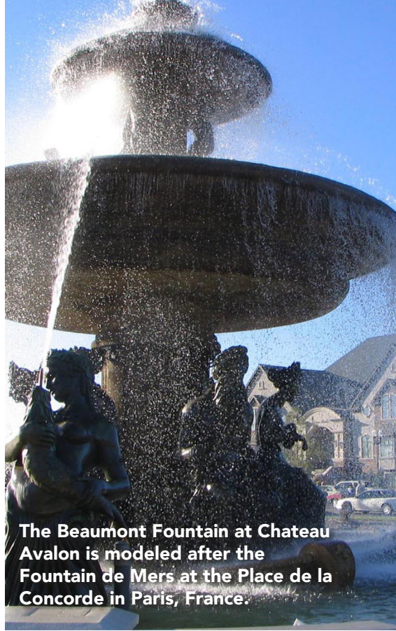
The Beaumont Fountain at Chateau Avalon is modeled after the Fountain de Mers at the Place de la Concorde in Paris, France.