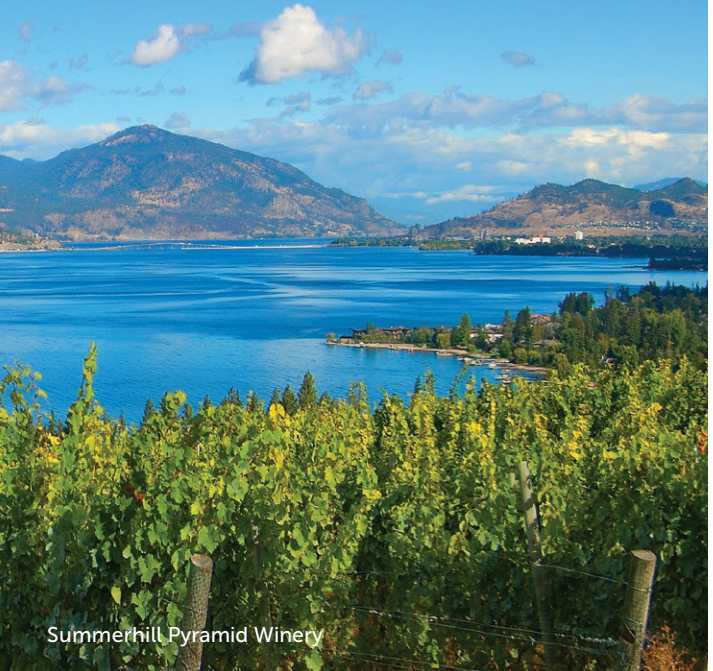
Summerhill Pyramid Winery