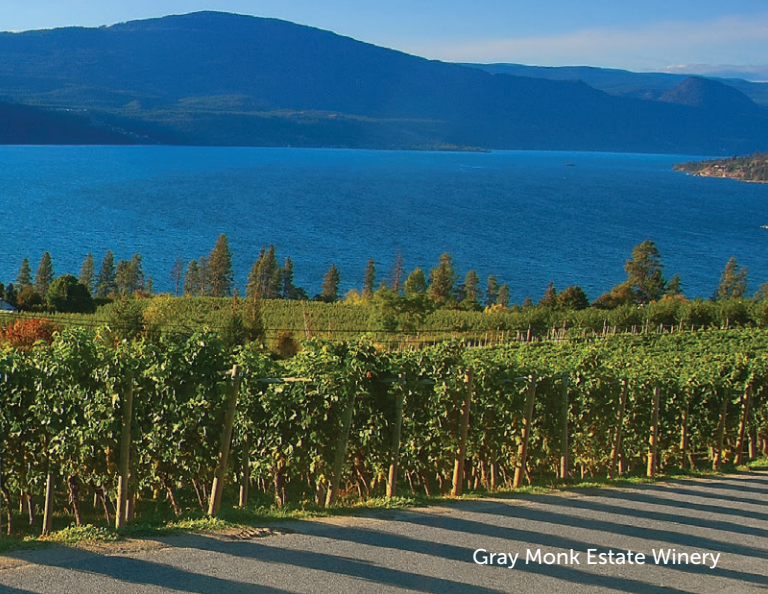
Gray Monk Estate Winery